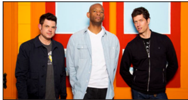
Well-known 90’s alternative band Better Than Ezra will perform during the Arts On The Allegheny (AOTA) Summer Concert Series, which will start at 7 p.m. July 23 at John P. Murtha Amphitheater at Kittanning Riverfront Park. The opening band will be The Wait, followed by the main act at 8:30 p.m.

The best songs, records, and bands transport you back to the first moment you heard them